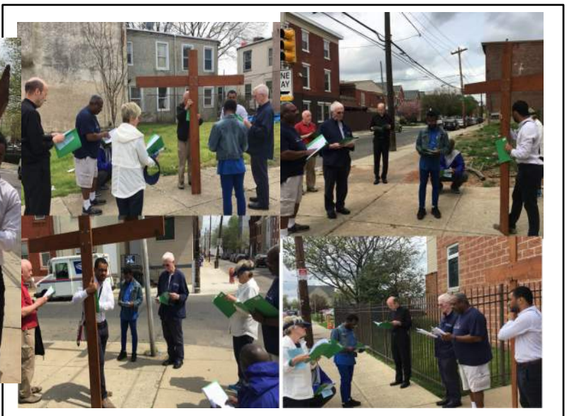
Images from Good Friday April 2019