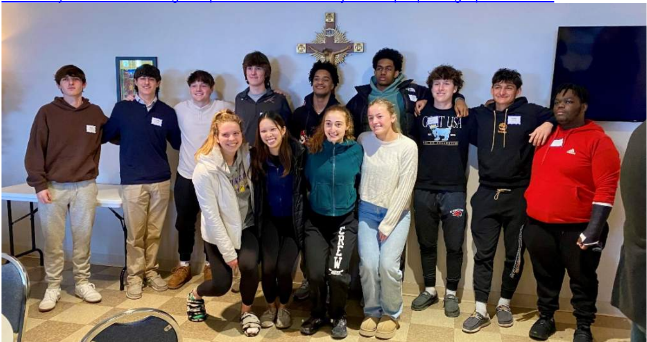
Photo of students at EcoPhilly from St Joe's Prep and other Catholic Schools: